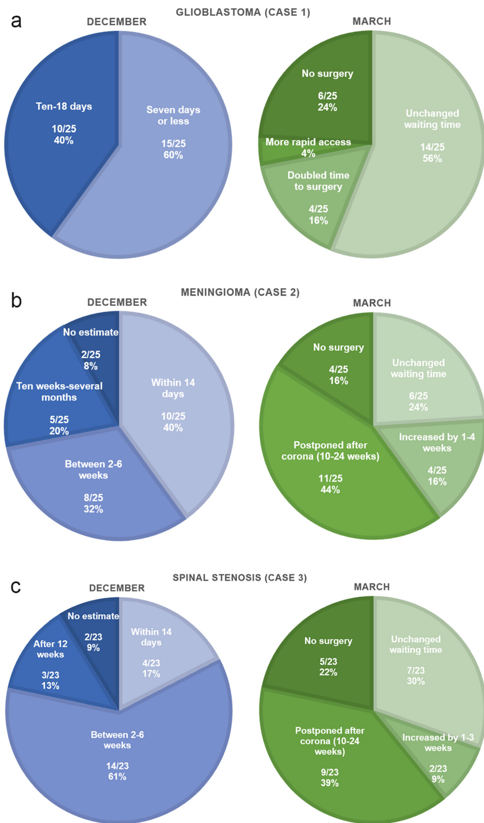
Fig. 2 a–c Expected time to surgery in December and March for the elective patients 1–3