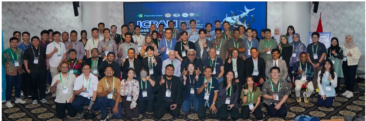
Participants in the Pre-Congress Global Neuro Foundation Course