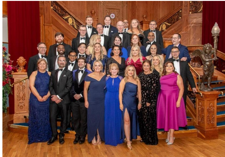
Our Hosts from Royal Victoria Hospital, Belfast – they scrubbed up well!