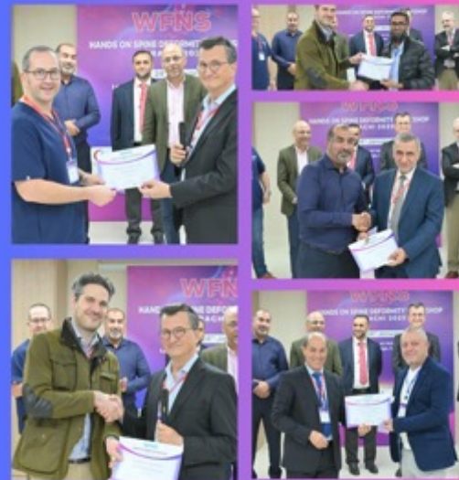
Hands On Spine Deformity Workshop