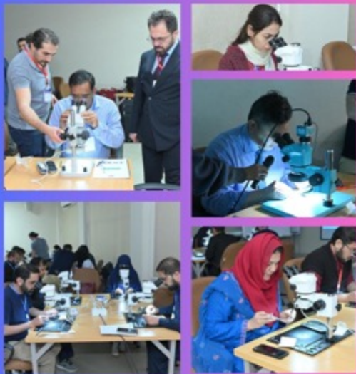
Hands On Microanastomosis Workshop