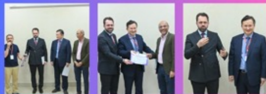
Hands On Microanastomosis Workshop