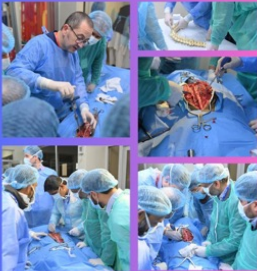
Hands On Spine Deformity Workshop