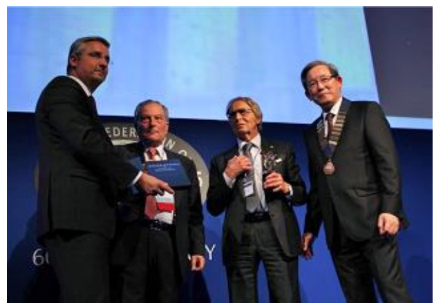
Awarding of the Medals of Honor