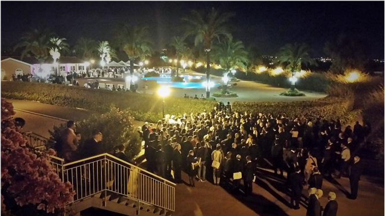
Elegant Social Events