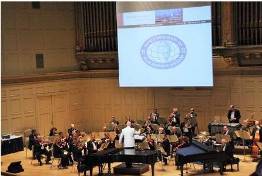
Opening Welcome at the Boston Pops in Symphony Hall