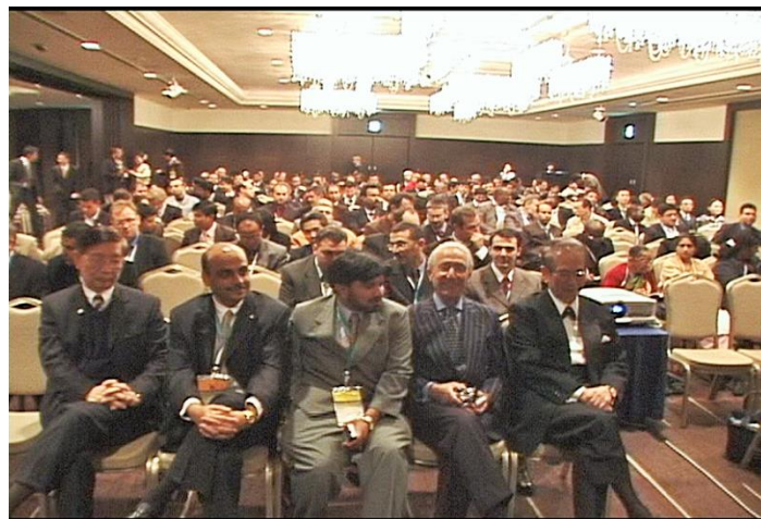
Young Neurosurgeons Session

Numerous Awards were given for Posters and Presentations, including the Prof. Raja Awards for Young Neurosurgeons.