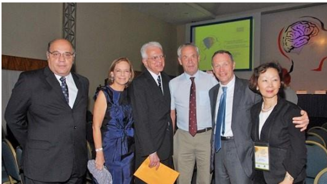
Officers and awardees

Registration was outstanding, totaling 1102 registrants and 119 accompanying persons, representing 88 countries. 209 of the possible 258 delegates were in attendance at the EC meetings. Extraordinary social activities included a Brazilian party and a Pernambuco party.