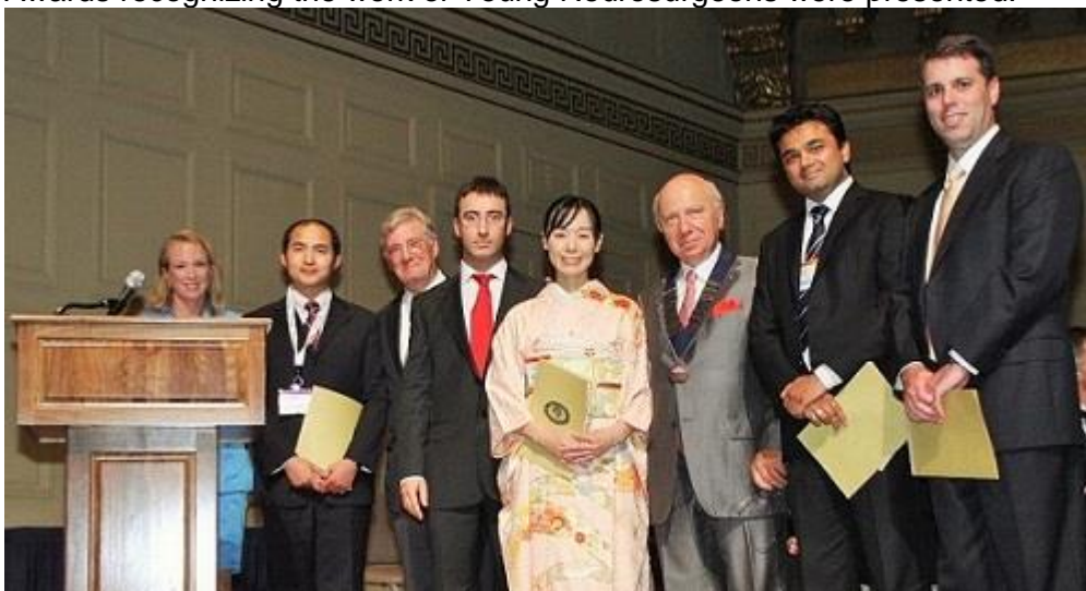
Young Neurosurgeon Awards at the 2009 WFNS Congress Opening Ceremony