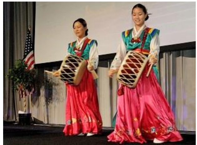
Traditional Korean dance and song at 2009 WFNS Congress Closing Ceremony