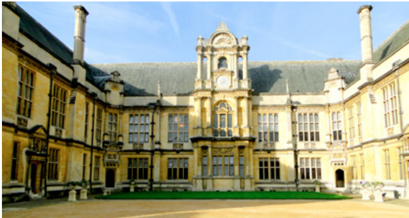
The Examination Schools, Oxford